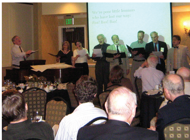
The Catchwords in full voice