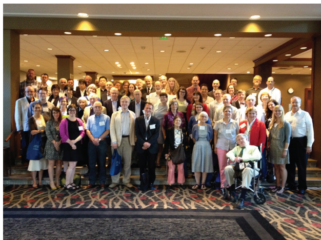
Attendees of the 2013 Biennial Meeting of the DSNA

The cover of the program booklet featured a memorable—indeed, unforgettable—picture of the university's mascot "Bulldog," seated in front of a trio of dictionaries and whimsically bespectacled for the occasion. One of the dictionaries bears